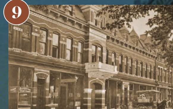
The Grand Opera House and Opera Block 110 East Court Ave.