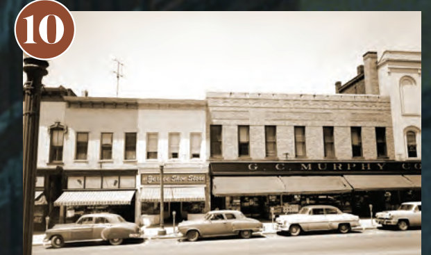
The G.C. Murphy Building 130 S. Main St.