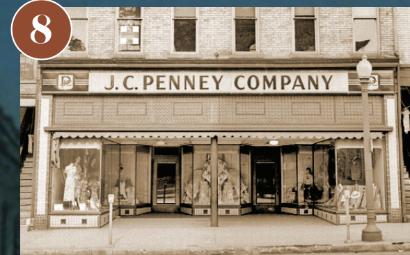
The J.C. Penny Co. 110 S. Main St.