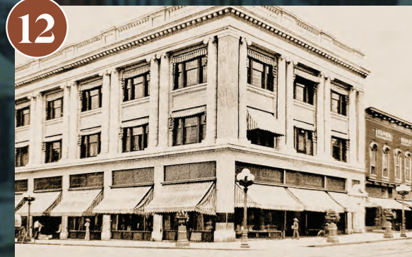
The Canby Building 144 S. Main St.