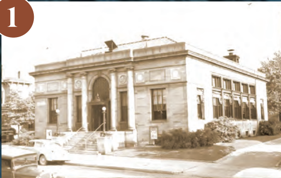
Historic Post Office 201 W Chillicothe Ave.

As you walk through our downtown, look for the bronze plaques displayed on the building fronts. They'll introduce you to a small piece of Bellefontaine's history, while you meet our amazing present-day merchants and learn to love the most lovable town in the state!