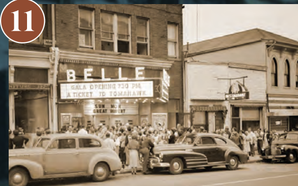
The Strand / Belle Theater 139 S. Main St.