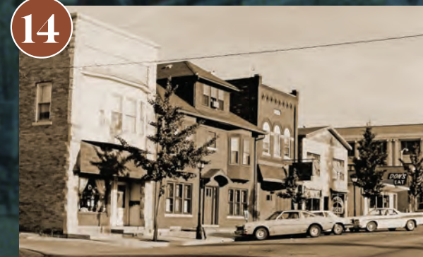
The Patterson Building 222 S. Main St.