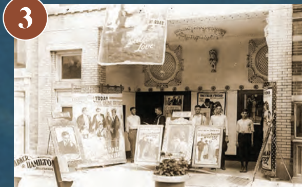
Cozy Picture Palace 208 W Columbus Ave.