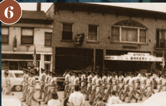
Dietrich Building 114-116 N Main St.