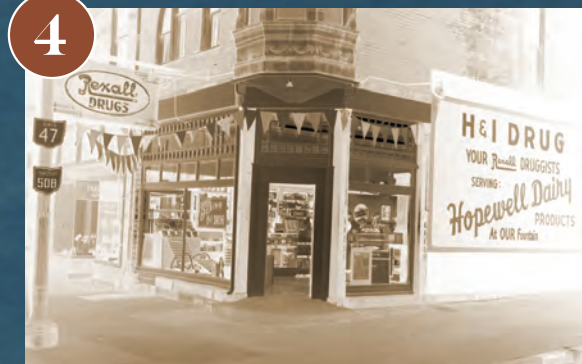
Gorges Building 200 W Columbus Ave.