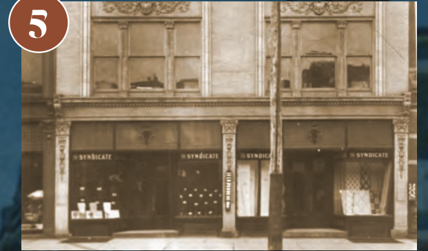
Kauffman Building 135 W Columbus Ave.