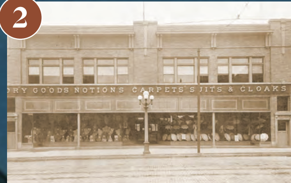
H.M. Annat Dry Goods 210 W Columbus Ave.