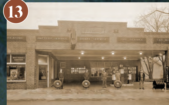
Shirks Logan Tire Co. 121 W Chillicothe Ave.